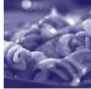
Table D'Hôte Menu